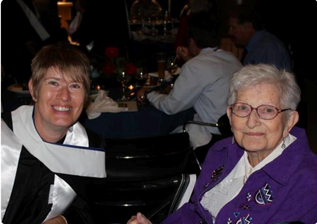
Graduation day 2011 at Gonzaga Avery proud mother:)